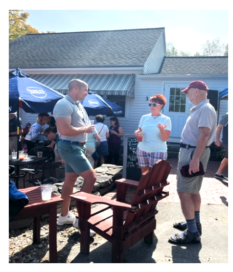
Our President and part of the winning team